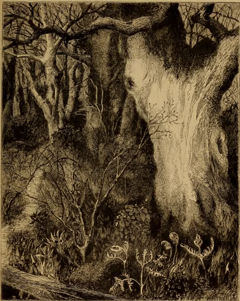
IN THE WOOD.